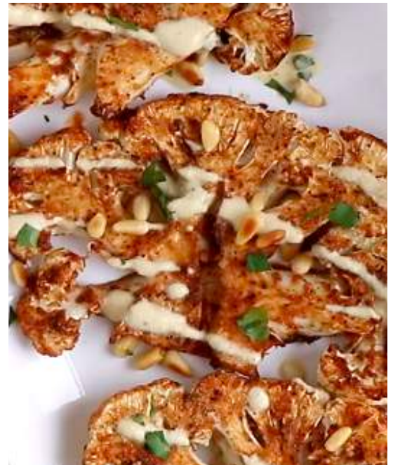
NO FAT. STILL DELICIOUS.