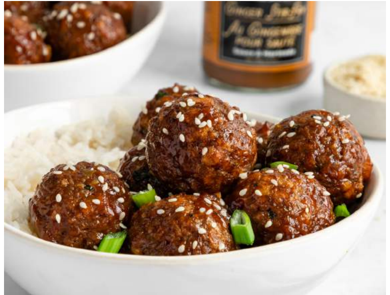
Recipe created by @purelykaylie