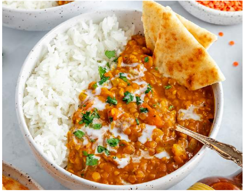
Recipe created by @purelykaylie