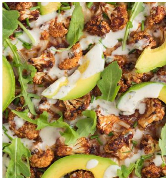
DELICIOUS FLAVOR WITHOUT ANY FAT