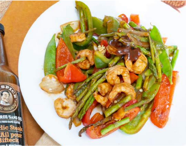
Recipe created by Victoria Squirlock