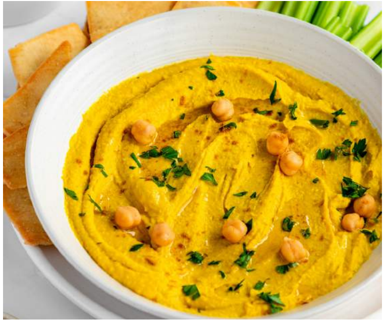
Recipe created by @purelykaylie